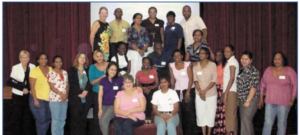
Learning: Delegates on the Current Issues in Instrument Processing workshop.

"Each participant received a certificate of