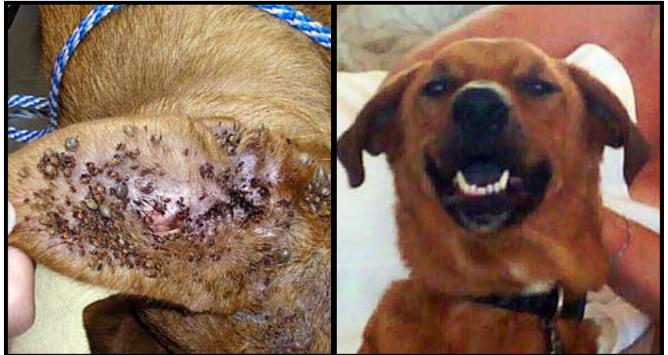
Before and after: Big Guy close to death and covered in ticks, and now, living the life of luxury.