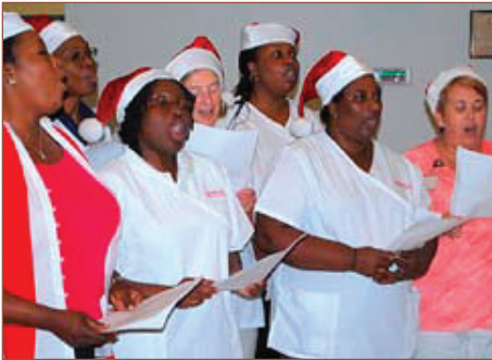
Members of the Staff choir entertain guests at Cheshire Hall.