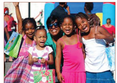
Smile: It's fun for everyone at the staff party