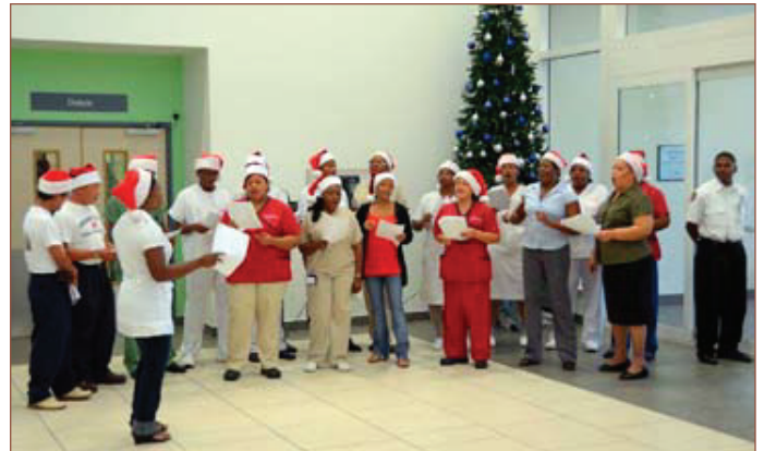
Cockburn Town choir in good voice.