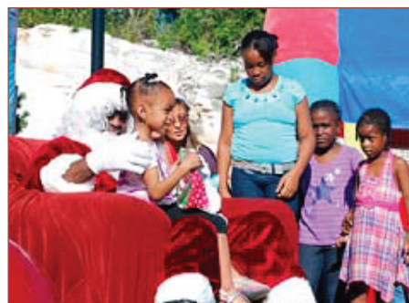
Presents: Santa hands out gifts to the children of staff members

"The whole of Britain has been suffering and it certainly makes me think of TCI when I'm shivering in the cold!!"