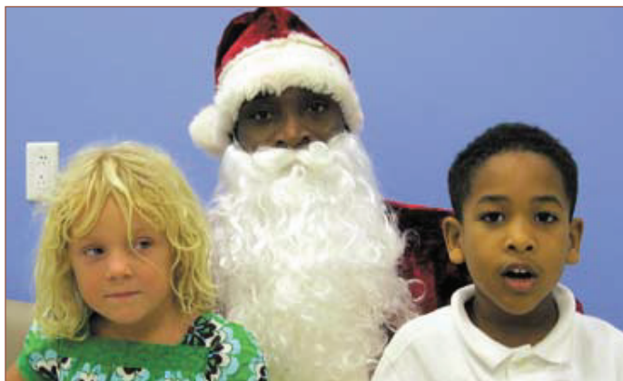
Ho,ho,ho: Father Christmas dropped in to the Cheshire Hall Medical Centre the other day. But can you guess which member of staff is under the white beard? Find out on page 6.