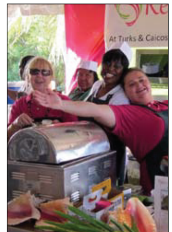
Tasty: The Refresh team take a break from serving up delicious conch at the 2010 Conch Festival

"Our stand certainly looked fantastic and there is no doubt in my mind that Interhealth Canada were the best in every department."